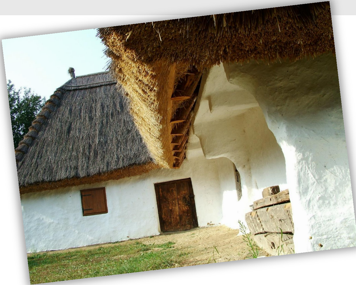
Traditional building with thatched roof and clay / straw mortar walls in Oszkó, Hungary